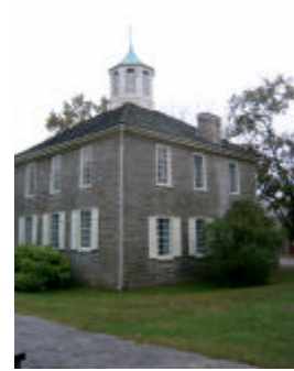
First State House in Corydon, Indiana