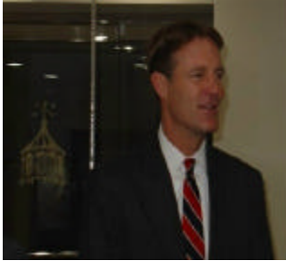
Senator Evan Bayh at The Corydon Group