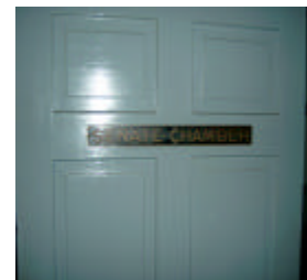
Senate Chambers at the Corydon, Indiana Statehouse